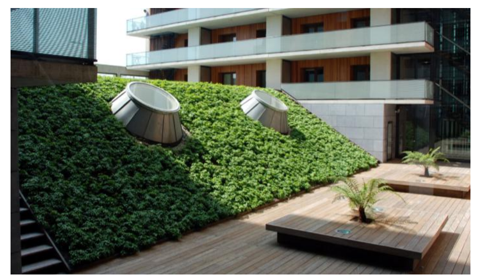
The inner courtyard of the "Australiëgebouw" with Pitched and Flat Green Roof.